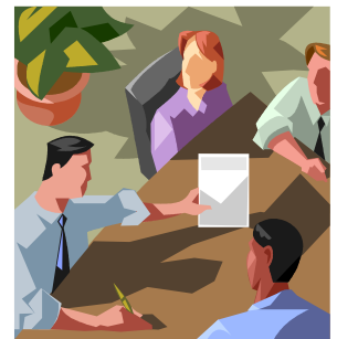
We would like to develop our virtual patient group further.

We would now like to develop our virtual patient group. This will enable