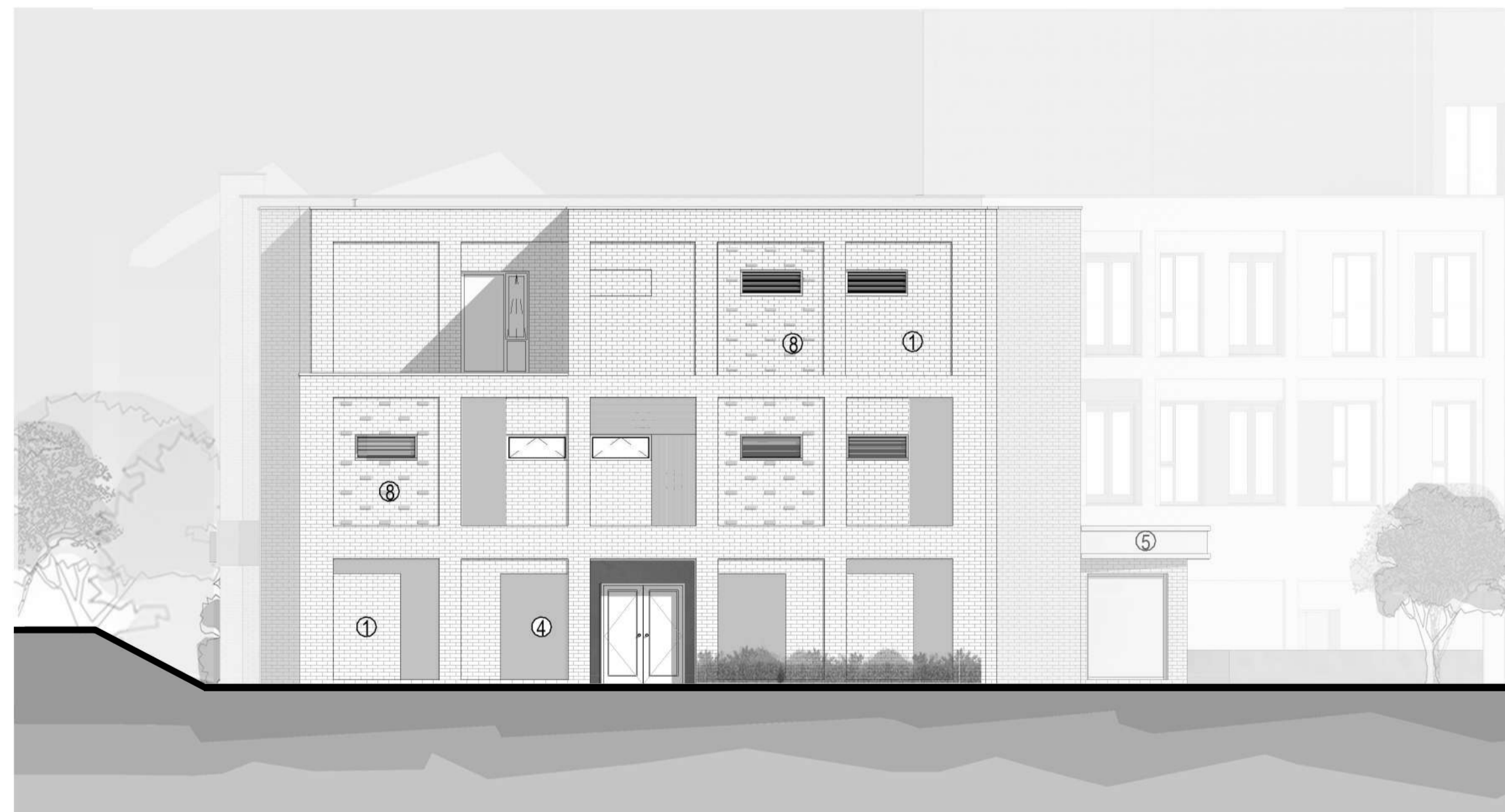
B Elevation B 1 : 100