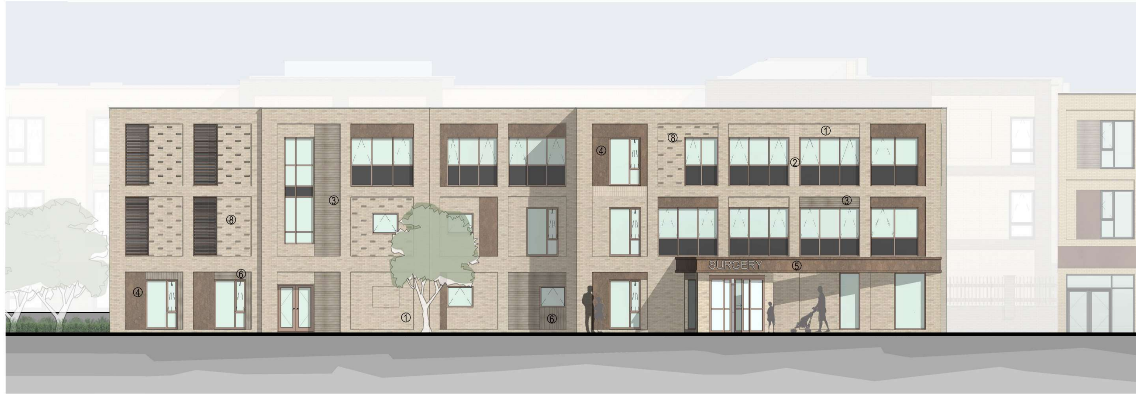
A Elevation A 1 : 100

NOTES Do not scale this drawing. All dimensions are in millimetres unless stated otherwise. This drawing is to be read in conjunction with all other relevant drawings and specifications. The copyright of this drawing is vested in Harris Irwin Associates Ltd. and must not be copied or reproduced without the written consent of a Director.